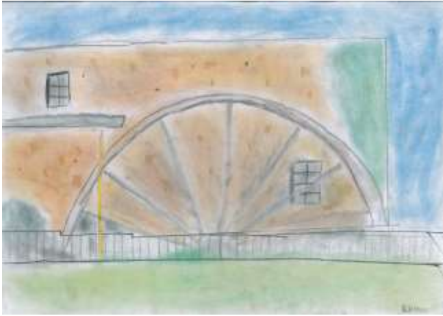
Bridgewater Mill, Built 1850 - Elektra