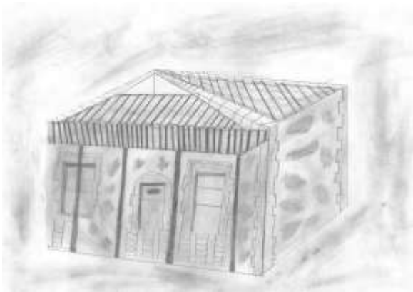
Forest Range Post Office –built 1859 - Kobi