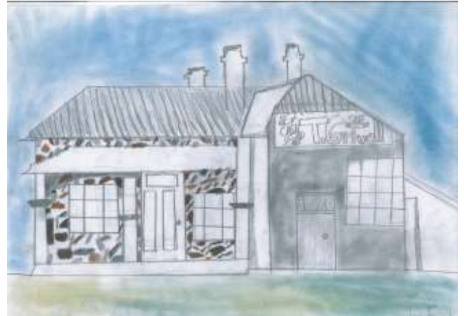
Grivell's General Store, Verdun